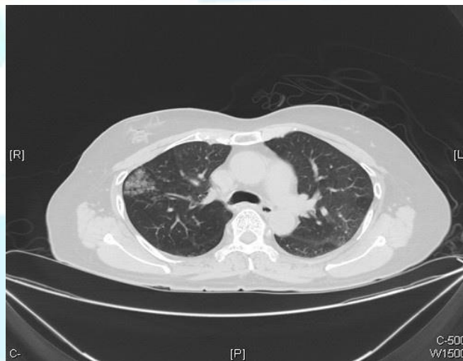
Figure 2: Cancer Patients Lungs CT Image (LIDC-IDRI dataset) [19]

At this stage of classification the classifiers are labeling the images in several consortiums to analyze the final result on digital image. The widely used classifiers for predictive analysis of Lung cancer detection are SVM Support_Vector_Machine [33], K-NN K-nearest neighbors [34], Decision tree and Artificial Neural Networks (ANN)[35]. This entire classification algorithm’s performance is measures on the basis of parameter of sensitivity, accuracy and specificity of proposed system.