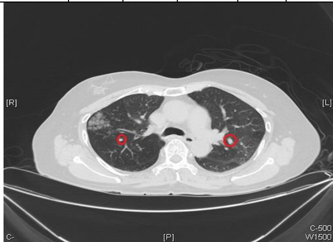
Figure 3: Cancer Patients Lungs CT Image with highlighting spot of cancer nodule (courtesy of LIDC-IDRI dataset)

At the end the comp. assisted diagnosis model (CAD) is to compare the obtained result from classification step for Lung Disease Diagnosis (LDD) and produces the final result. The figure 1 and figure 2 are the (courtesy of LIDC-IDRI dataset) of low dose Lung CT images of cancer patient, normally it is challenging for medical professionals to detect the cancer nodule and come to the final decision, the red spot highlighted in figure are the cancer nodules, however it is complex to conclude the exact nodules, the proposed system performs the segmentation and classifies the cancer nodule using R-CNN robust classification techniques.